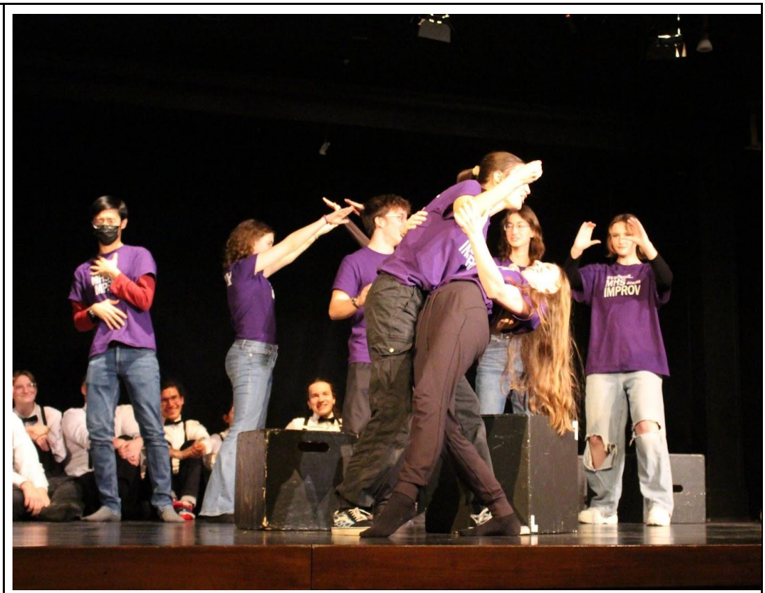
The Merivale Improv teams competed in the Improv Games competition on March 24th & 25th and did an awesome job! The Seniors made it to finals

The junior and intermediate bands are being recorded this week to submit their music to Nationals for Music Fest.