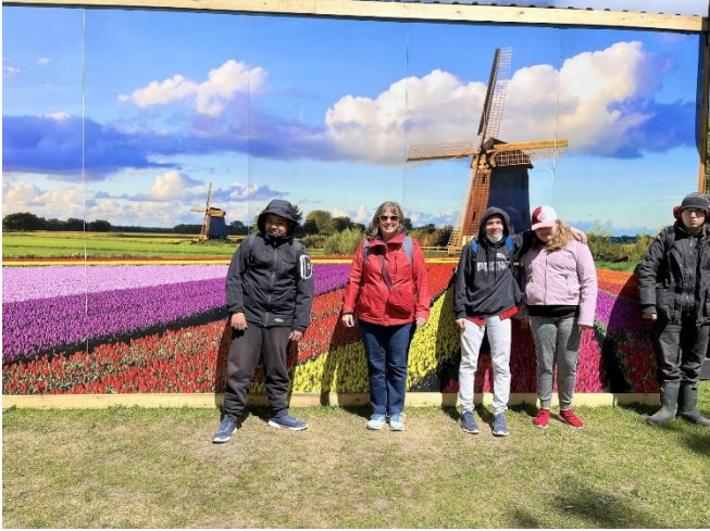
May was a busy month for our class as we attended two different track and field events and we had a chilly day at the tulip festival.