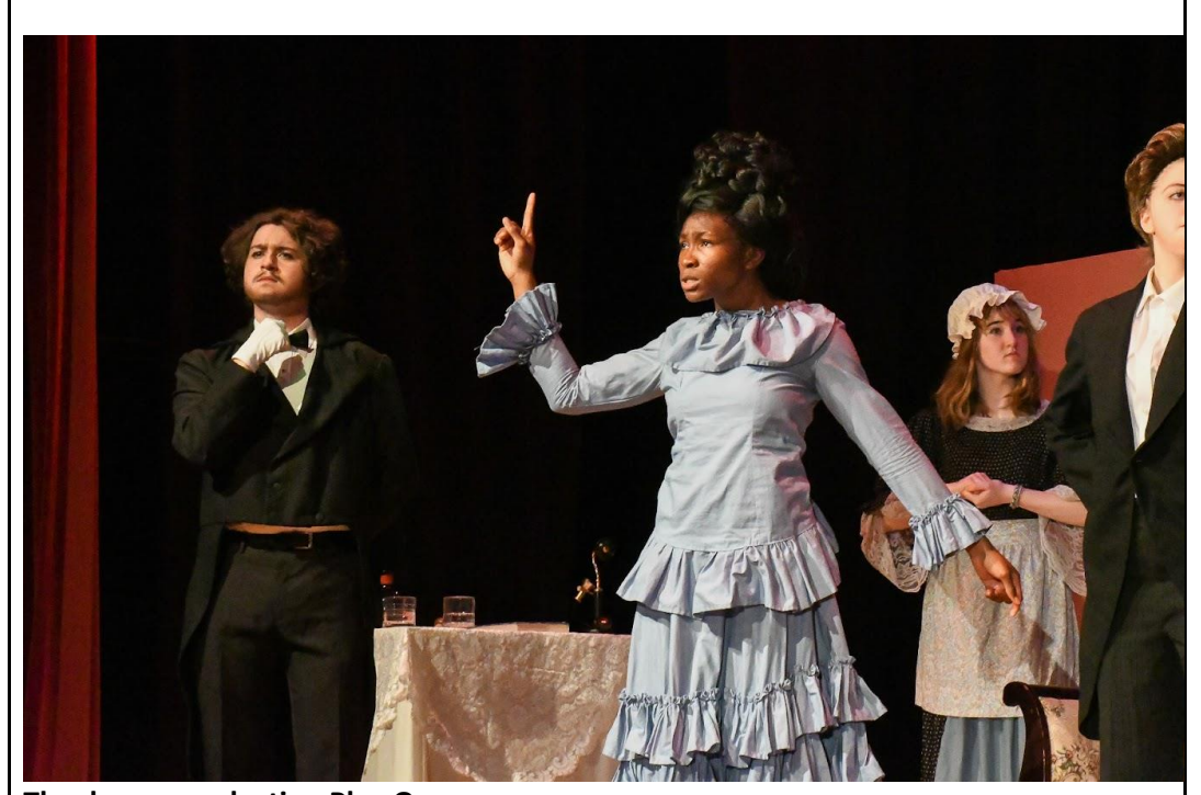
The drama production Play On was a success. Next up - Spring Music concerts are taking play May 24 and 25th